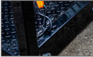
Easy Access Tie Downs