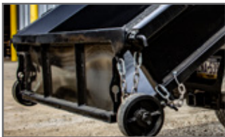
2-Way Dump/Ramp Gate