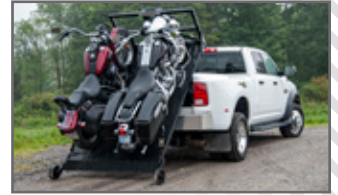
2,500 Lift Capacity