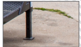
Extendable Deck Feet