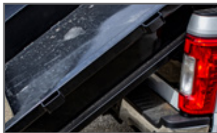
Stake Pockets/Rub Rails