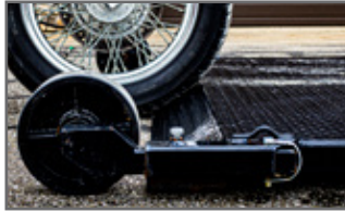
45° Rear Approach Angle