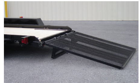
Landscape Ramp (optional)