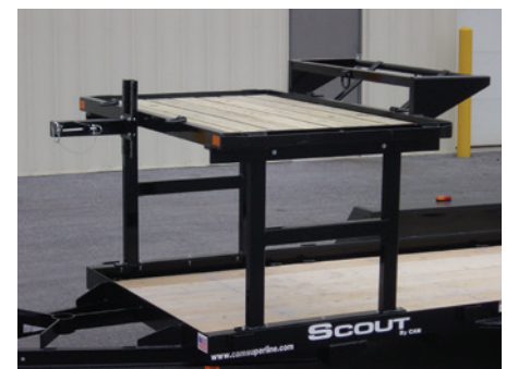
Attachment Package (optional)