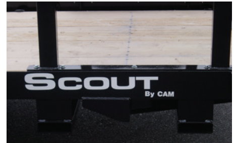
Pallet Fork Carrier (optional)