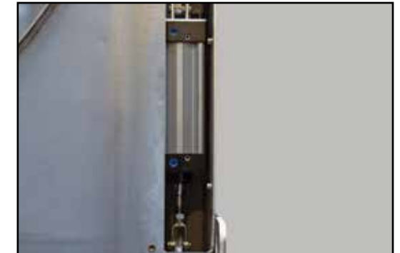
Dual air tailgate cylinders standard