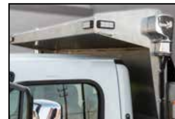
Cab shield with Built-In Tarp System