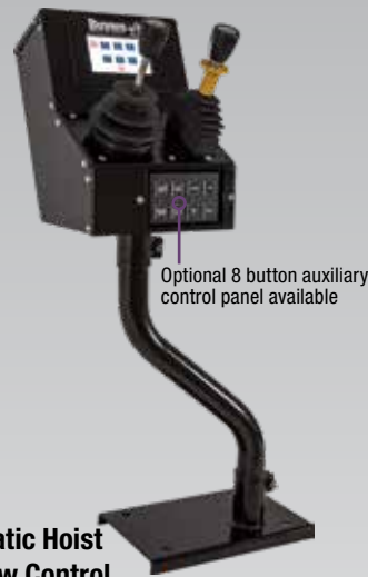
Optional 8 button auxiliary control panel available

The Buyers Products Company Central Hydraulic System (CHS) is unmatched in functionality with its small footprint design and controller providing convenient plow, spreader and hoist operation. Contact Buyers for other configurations.