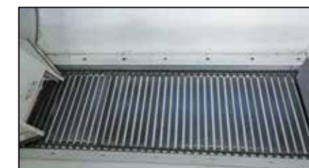
30.25" wide conveyor with 1/2" bars