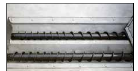
Dual 7" auger drive