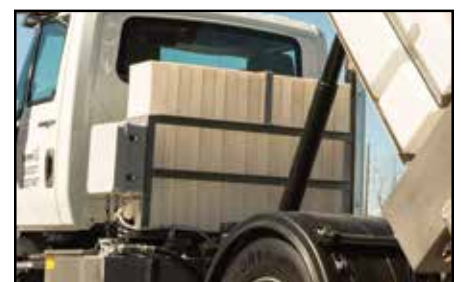
LS12 (Behind Cab Mount 120 gal.)