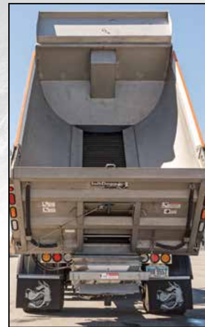
Unique, roll-formed sides and cross member-less design