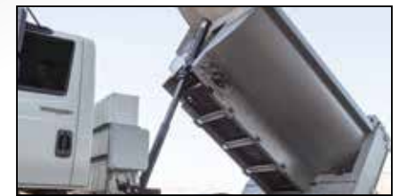
Mailhot® multi-stage, double-acting, nitrided cylinder, trunnion-mounted hoist