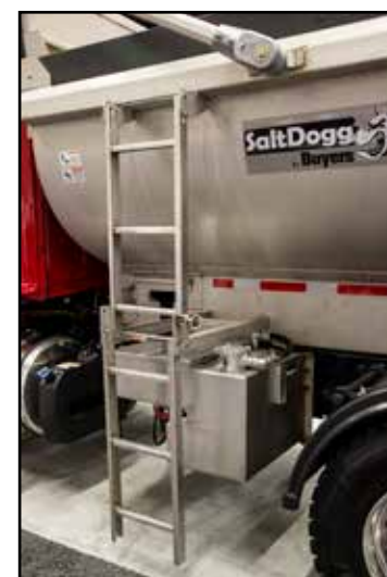
Ladder shown extended down