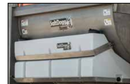
LS11 (MDS Mount two, 160 gal.)