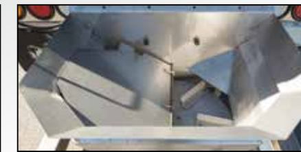
"Hex flow" chute and 24 inch spinner with adjustable baffles for optimal spread pattern