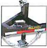
7K TOPWIND DROPLEG JACK (12K TOPWIND DROPLEG JACK ON 14K MODELS)