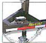
7K TOPWIND DROPLEG JACK (12K TOPWIND DROPLEG JACK ON 14K MODELS)