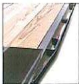
FULL-LENGTH RUB RAILS