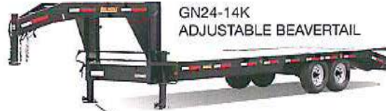
GN24-14K ADJUSTABLE BEAVERTAIL

DUAL 12K SIDEWIND DROPLEG JACK (SINGLE 12K SIDEWIND DROPLEG JACK ON 10K AND 12K MODELS)