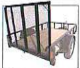
5 RIB HD MESH RAMP (5X TRAILERS) 6 RIB HD MESH RAMP (6X TRAILERS)