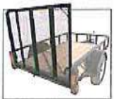
5 RIB HD MESH RAMP (5X TRAILERS) 6 RIB HD MESH RAMP (6X TRAILERS)