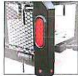
LED LIGHT TOWER