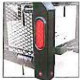
LED LIGHT TOWER