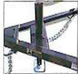
SET BACK JACK