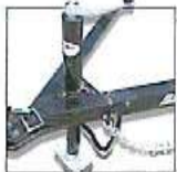
JACK STAND WITH FOOT.