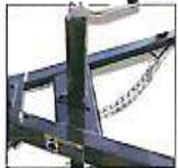
SET BACK JACK