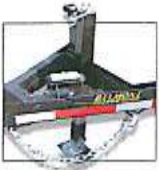
7K TOPWIND DROPLEG JACK (12K TOPWIND DROPLEG JACK ON 14K & 16K MODELS)