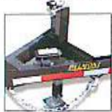
7K TOPWIND DROPLEG JACK (12K TOPWIND DROPLEG JACK ON 14K & 16K MODELS)