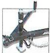
2K TOPWIND JACK A-FRAME