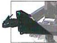
2 5/16" ADJUSTABLE COUPLER