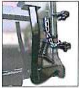
HEAVY DUTY LATCH