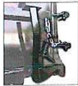
HEAVY DUTY GATE LATCH