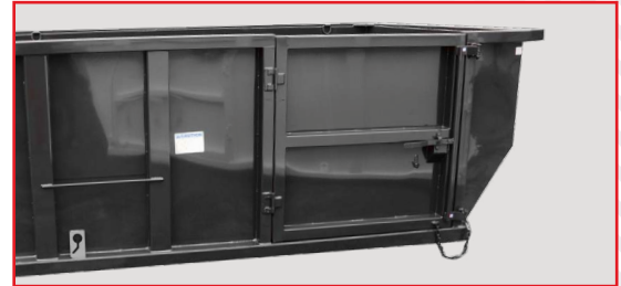
Curbside Door (Available only on Medium & Heavy Duty and only 10' or Greater.)