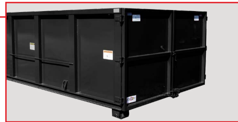
Single swing or barn doors