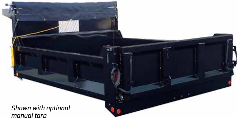
Shown with optional manual tarp