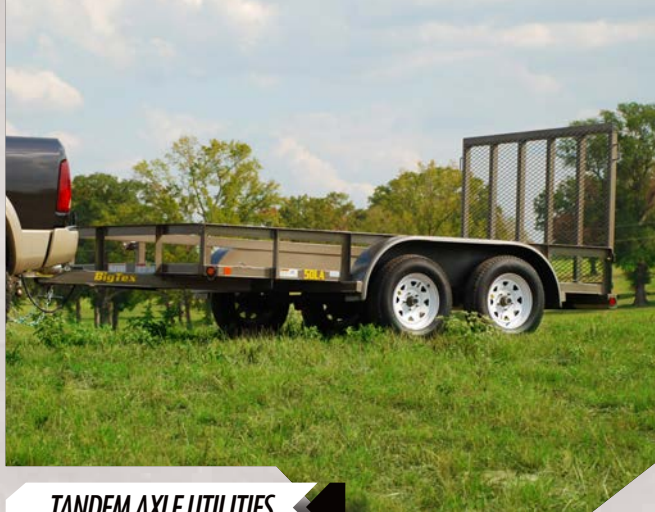
TANDEM AXLE UTILITIES