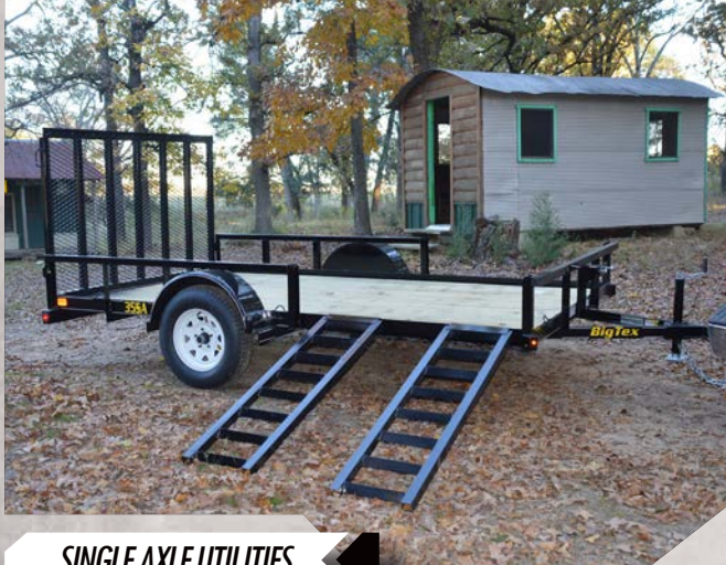
SINGLE AXLE UTILITIES