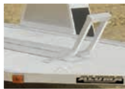
Motorcycle Brackets All Models