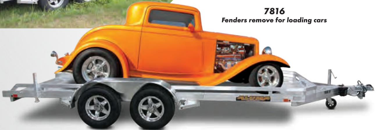
7816 Fenders remove for loading cars