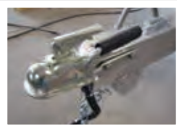
Tongue Handle All Models