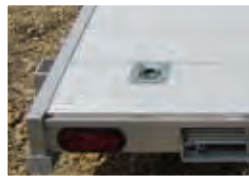
Stainless Steel Recessed Tie Rings All Models