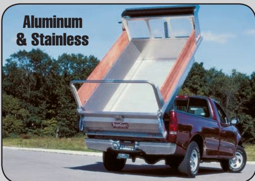
Aluminum & Stainless