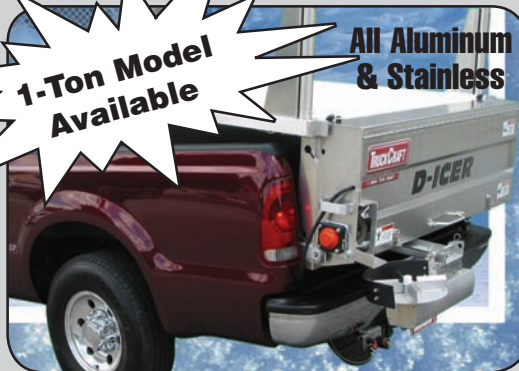
All Aluminum & Stainless